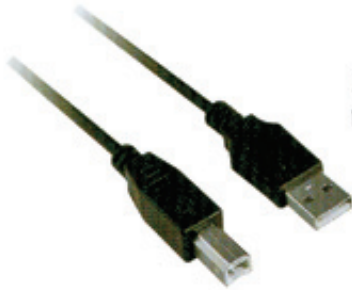
LS-12001 USB AM/BM