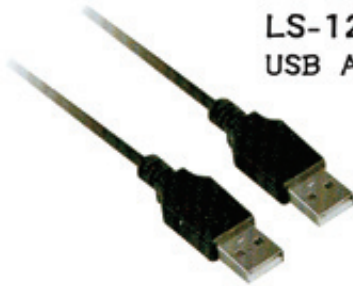
LS-12003 USB AM/AM