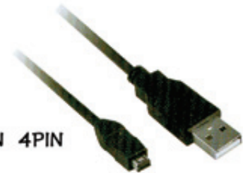
LS-12004 USB AM/MIN 4PIN