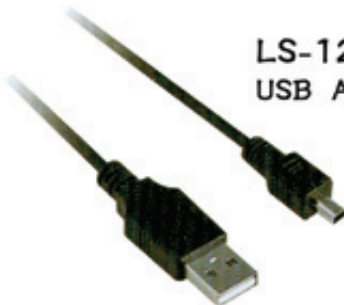
LS-12005 USB AM/MIN 4PIN D Type