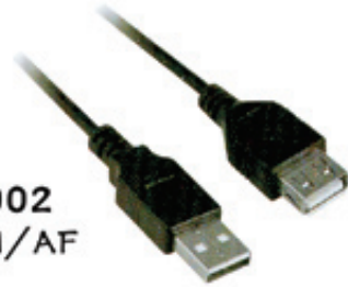
LS-12002 USB AM/AF